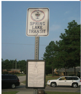
CROSS CREEK MALL